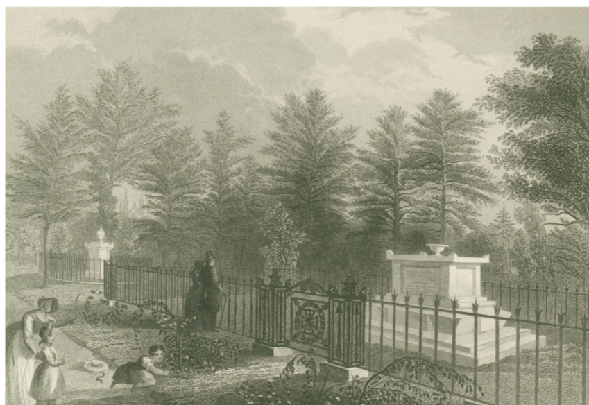
Dr. Channing's Monument.

In the fall of 2015 the Channing monument was inspected and assessed by conservators from Daedalus, Inc. Proposed conservation treatment will include gentle washing with soft brushes to reduce the soiling, filling cracks and joints. Washing, pointing, and repair will be performed by trained and experienced conservators. After treatment, the Channing monument will be monitored regularly by Mount Auburn's preservation staff. Although stopping the degradation of stone entirely is not possible, Cemetery staff and professional conservators are confident in their ability to stabilize the stone and extend the life of the historic monument.