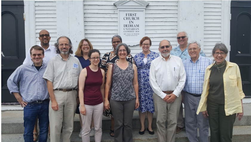
The new and old UUHHS Board of Trustees met at the end of July in Dedham, Massachusetts for the annual meeting.